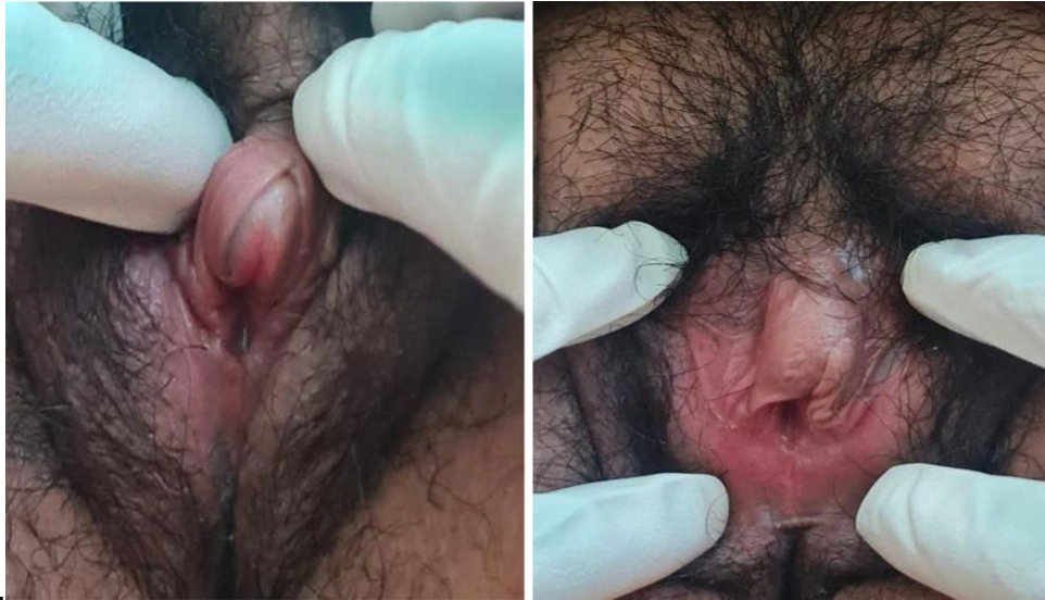
Figure 2. Adults with congenital adrenal hyperplasia

The results of a complete hematological examination did not show any abnormalities. Hormone examination found LH, FSH, Estradiol, Testosterone, DHEA-S, Kortisol was within normal limits, and cytogenetic analysis revealed 46, XX, apparently a normal female karyotype.