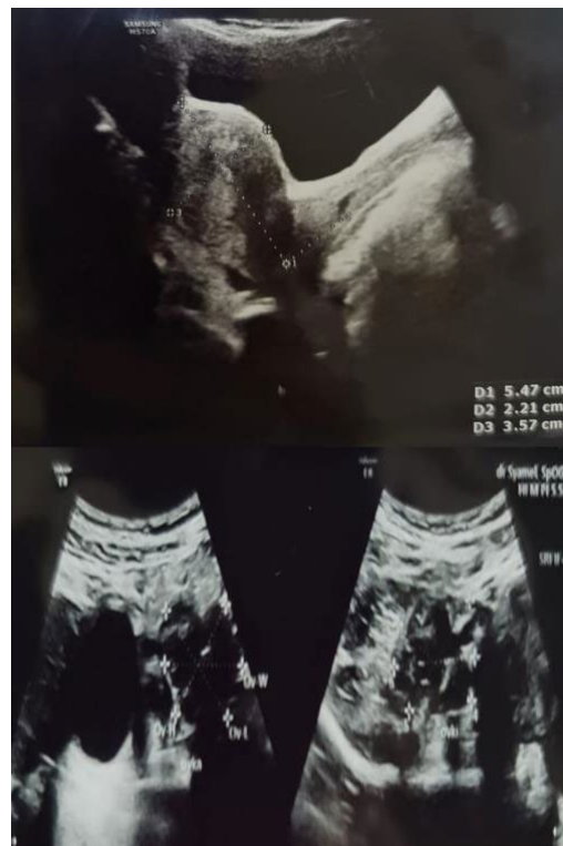
Figure 3. Ultrasound of the uterus and ovaries

The results of a complete hematological examination did not show any abnormalities. Hormone examination found LH, FSH, Estradiol, Testosterone, DHEA-S, Kortisol was within normal limits, and cytogenetic analysis revealed 46, XX, apparently a normal female karyotype.