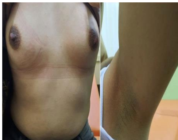
Figure 1. Secondary sexual characteristics: (A) Breast, (B) Axilla

A 32-year-old patient, unmarried, came to the urogynecology department complaining of thickening of the upper genitalia resembling male genitalia. This problem has been known to the patient since he was 16 years old and was brought to the doctor at the age of 21 and diagnosed with congenital adrenal hyperplasia. The patient claimed to have had menstruation since he was 14 years old, but not every month and a little. Since 8 years ago, the patient routinely took hydrocortisone from an internal medicine specialist but had never been to the obstetrics and gynecology department for 8 years, now the patient comes to the urogynecology department because he wants to get married. which is quite good. In the family history, there was no family history of congenital abnormalities. From a physical examination, his height is 150 cm. He shows the habitus of the external body like a woman. From genital examination, pubic hair appears, enlargement of the clitoris is similar to that of a male penis.