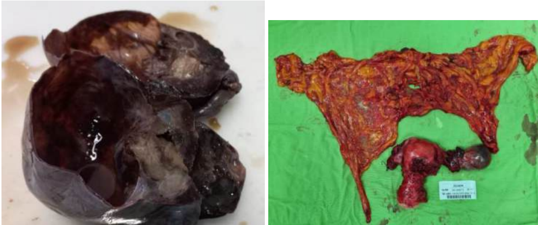
Figure 3. Ovarian tumor solid and cystic mass with uterine tissue, contralateral adnexa and omentum.

The patient was then referred to Dr. M. Djamil Padang after knowing the results of the anatomical pathology is a papillary thyroid carcinoma. The patient was then advised to undergo surgical staging and the patient agreed. After surgical staging, the tissue was examined and the anatomical pathology results showed no malignant tissue found in the uterus, contralateral ovary, omentum and peritoneal washing cytology, it was concluded that the diagnosis in this patient was Struma Ovarii with Papillary Thyroid Carcinoma stage IA1. The patient was planned for follow-up, for thyroid ultrasound examination and follow-up of thyroid function to ensure that there is no hyperthyroidism and no malignancy in the thyroid organ. Patients were advised to undergo chemotherapy with a regimen of Foncopac 280 mg and Carboplatin 480 mg for 6 cycles.