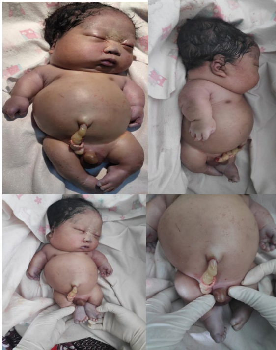
Figure 2: Postmortem examination: hypertelorism, low nasal bridge, cranio-facial disproportion, narrow chest with protruding abdomen and short, bent limbs.